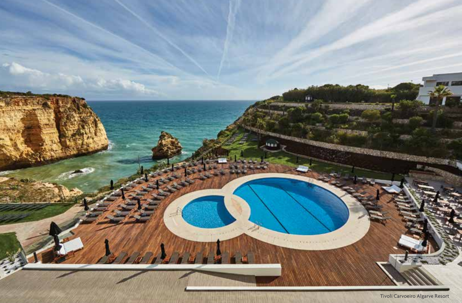
Tivoli Carvoeiro Algarve Resort